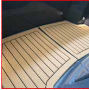
EVA Faux teak deck