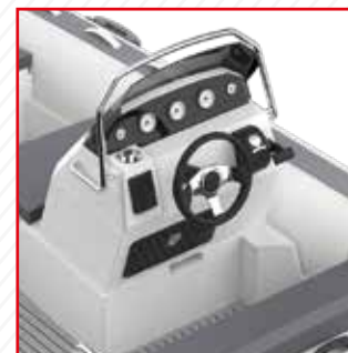
Console railing (4.2 / 4.8 / 5.3)