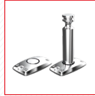
Pop up ski tow pylon (4.2 / 4.8 / 5.3)