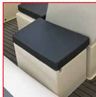
Additional seat (4.2 / 4.8 / 5.3)