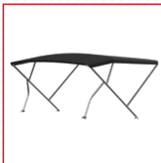
Bimini Top (4.2 / 4.8 / 5.3)