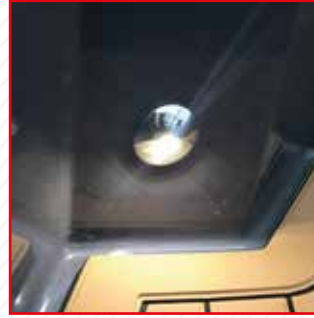
LED floor lighting